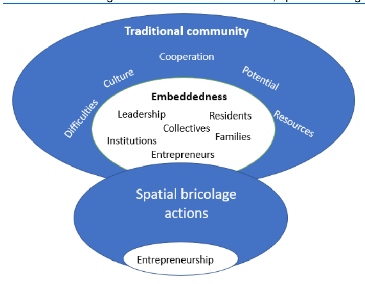
Figure 2 . The theoretical model proposed.

This theoretical model suggests a cycle that relates the issue of resource use to the local potential since, as Yachin and Ioannides (2020) highlight, local resources are exploited by entrepreneurs who mobilize the community as a whole. Thus, cooperation is influenced by resource mobilization in the community and each community might have different cooperation levels among entrepreneurs or residents (Korsgaard et al., 2015).