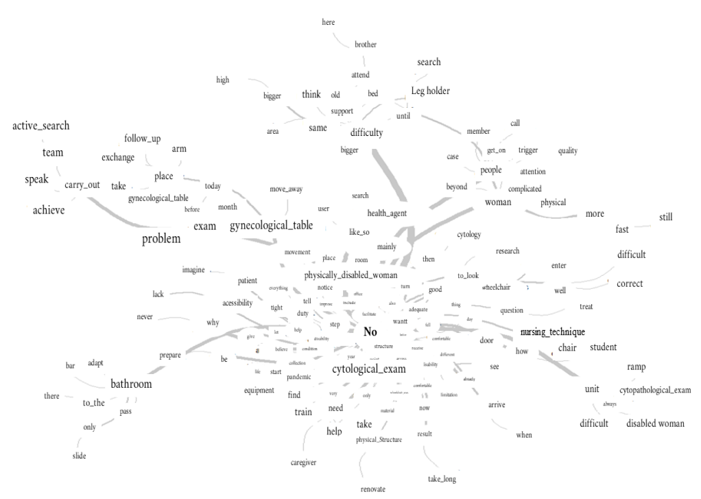
Figure 1 - Graphic representation of the similitude analysis between words. Campina Grande, PB, Brazil, 2021