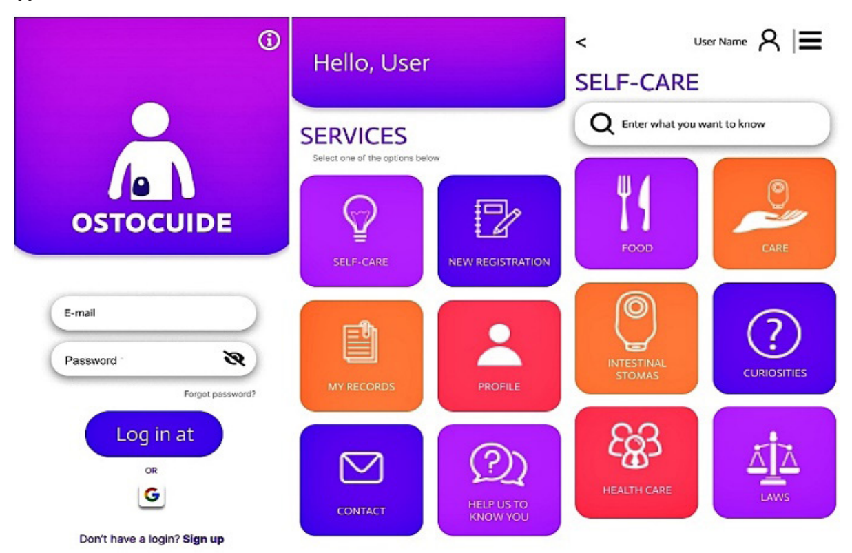
Figure 2 - Start screen, main menu, and self-care menu of the Ostocuide app. Natal, RN, Brazil, 2020

and interactive questions. The content and selection of the menus were based on the scope review and qualitative study, as well as on the aspects for ease of access by the user. Figure 2 shows the home screen and the main menus that make up the application.